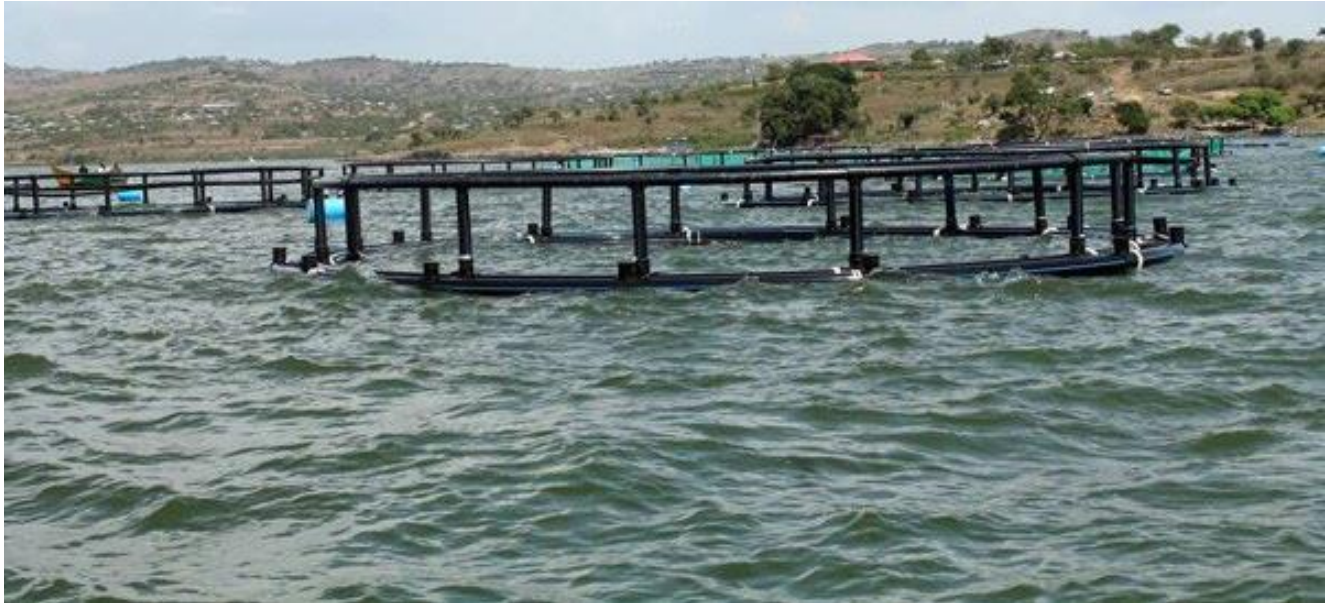
Figure 1: Circular HDPE Cage