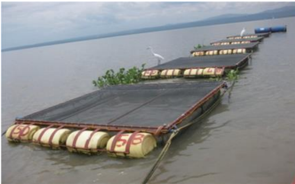
Figure 2: Rectangular metallic fish cages

The problem associated with fish cages is the organic pollution from the leachates coming from them. The leachates include uneaten feeds, fish feces and other wastes that sink to the lakes