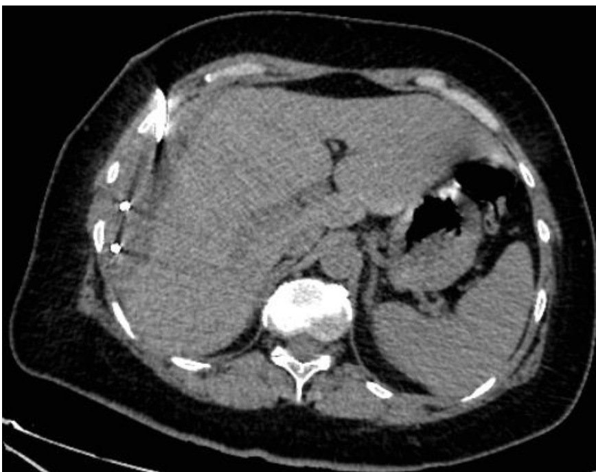
Figure 3: CT-scan at the first day after drainage