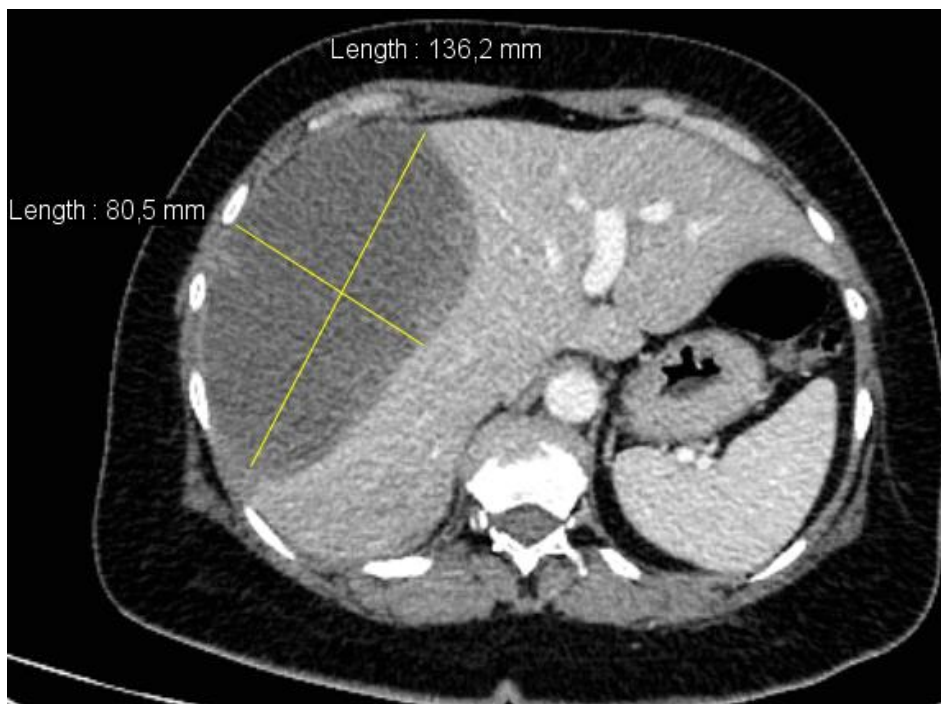
Figure 1: CT-scan showing sub-capsular hepatic hematoma, developed at the expense of segments VI, VII, and VIII of 136 x 80 mm in diameter